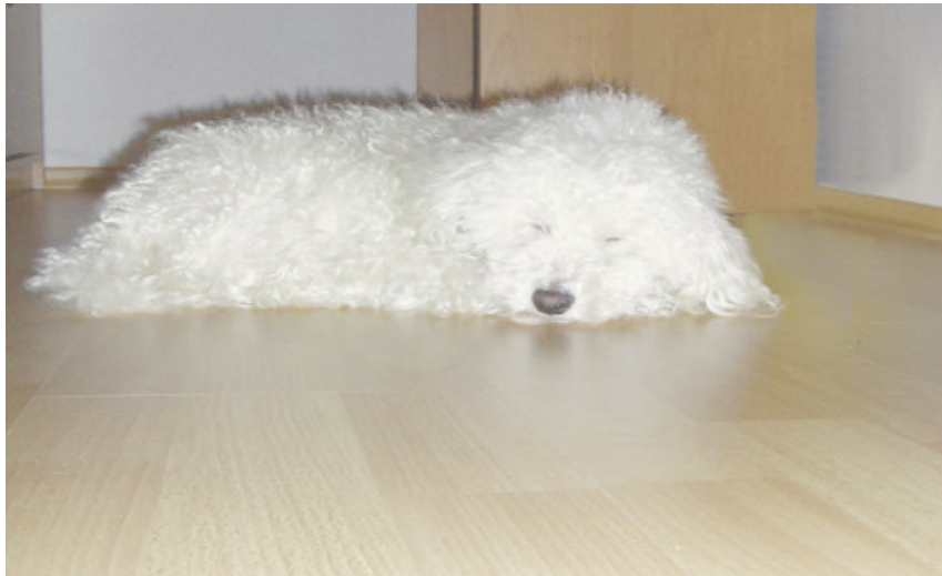
Comfort for everyone